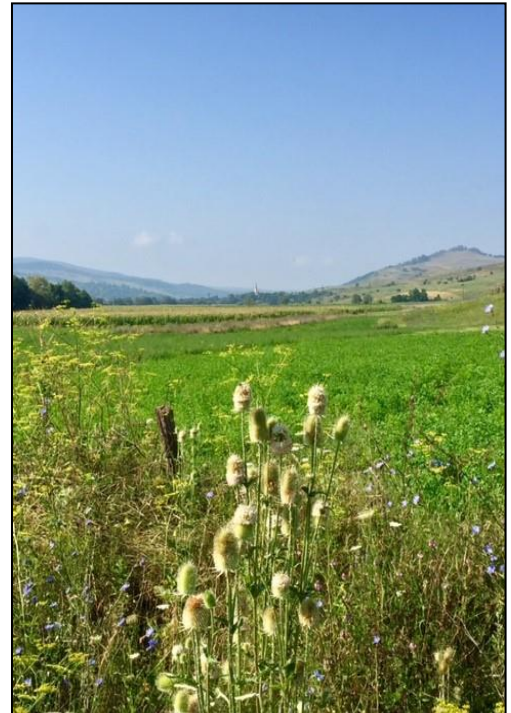
Picturesque Homorod Valley

During the walk, pilgrims will engage in short didactic sessions on religious history, Transylvanian community life, as well as personal spiritual practices. Our walking will culminate in a climb to the mountain-top fortress above Deva where we will gather for an evening vesper service outside the prison cell where Francis David. On the final day of the trip we will again board buses for the return to Cluj (Kolosvár) for our farewell dinner and folklore show.