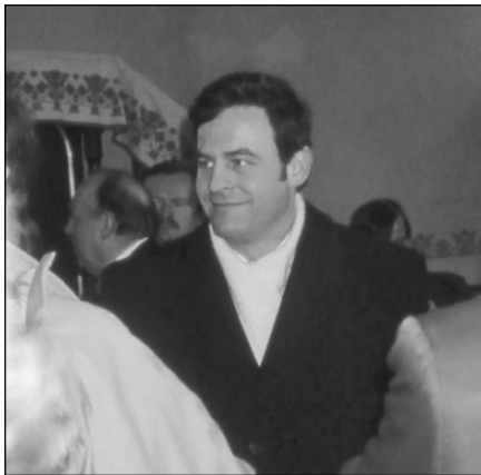
Rev. László Tőkés, of the Reformed Church, “Hero of Timisoara” at his surprise visit to the church in Marosvásárhely.