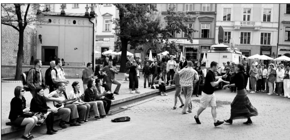
In a street Krakow: the Kolozsvár theological students perform traditional Hungarian folk dances—for the enjoyment of the passers-by.