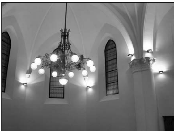
Part of the restored church, with stained glass windows.