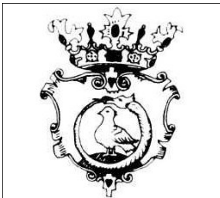
Coat of Arms of the Transylvanian Unitarian Church.