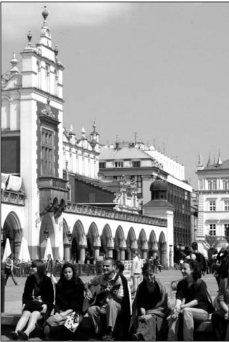
Enjoying the Krakow town square.

we were deep under the ground like never before. It is a wonderful place: with its silence and depth, our energy was returned to us. The closing ceremony of the day was a common dinner with specifically-Polish food and drink. It was an extraordinary day with great moments which will remain alive in our memories.