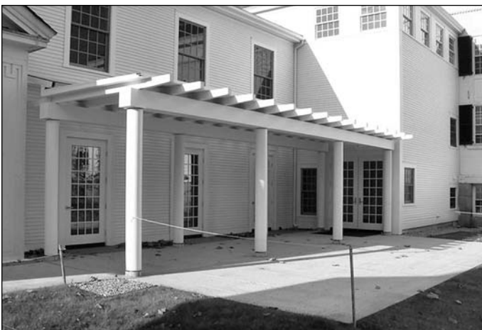
The "Keresztúr Terrace" is part of the newly-renovated building at First Parish in Concord.

We spent the second part of the day at the world-reknoned salt mine; (Continued on the next page)