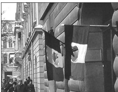
1990: the Romanian flags with the hammer-and-sickle symbols cut out. (See Schulz Report, p. 7,8)

Available for $15 (postage & handling included) from Campicello Press, P. O. Box 417, Madison, VA 22727. Inquiries: gkbeach@aol.com. This book will also be available at the UUPCC booth at General Assembly.