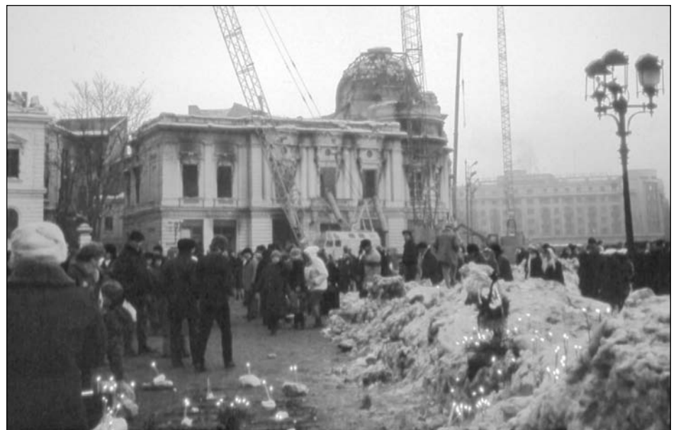
Bucharest, 1990: National Library with memorial candles—a tribute to those who died in the December 1989 uprising. (This picture is from a slide scanned by Rodger Mattlage of the First Parish in Concord, MA.)