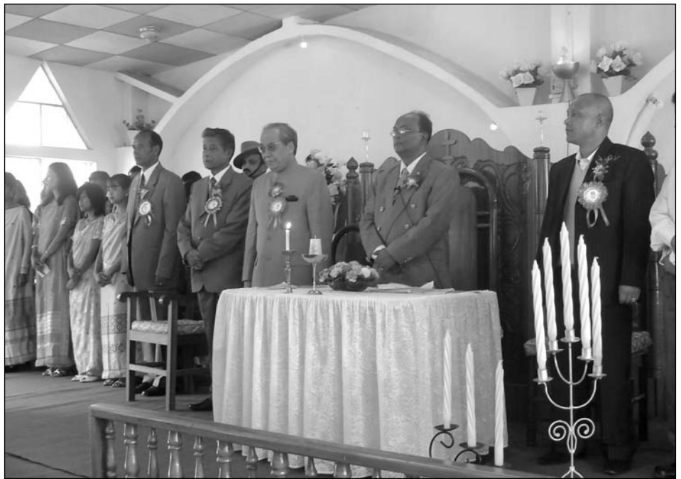
Founder's Day celebration at Madan Laban church.

Founder's Day was celebrated in a grand manner this time. We had the Governor of the State attend as the chief guest and the children presented a beautiful welcome song. The Governor was all praise for "this liberal and tolerant faith". He was amazed to see an interfaith gathering which took part in chalice lighting. The kids had fun throughout the celebration and prizes were distributed to the winners of the various competitions organized as part